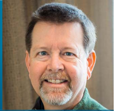
John Solvie Chair