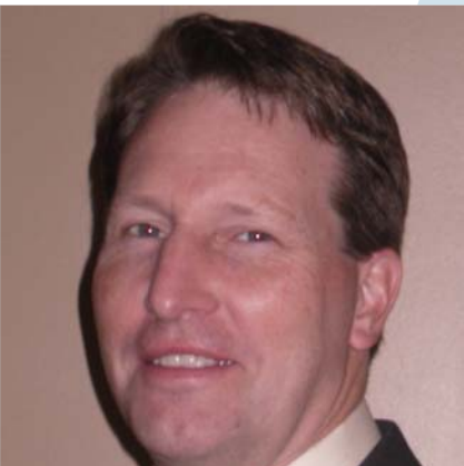
Jim Kincaid Public Commissioner